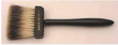
SERIES 31S --- FRENCH BADGER BLENDER Size 3