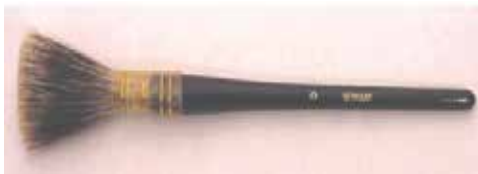
SERIES 32 --- GERMAN ROUND BADGER BLENDER Size 6